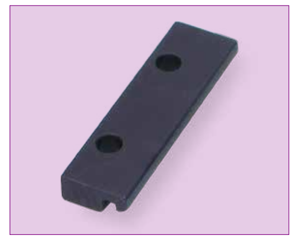
Four BiSlide cleats are available: standard one- and two-hole, sandwich, and an optical cleat. Pictured is the standard cleat used to mount a BiSlide to a base, frame or to another BiSlide Assembly. Each pair has 425 lbs. of holding capability.

The BiSlide® Assembly base should be mounted with Velmex MC cleats to a reasonably flat surface. Inaccuracies and binding can result if mounted to non-flat surfaces. Mounting surface should be steel or aluminum and have 1/4-20 UNC threaded holes with a minimum thread depth of 0.30"